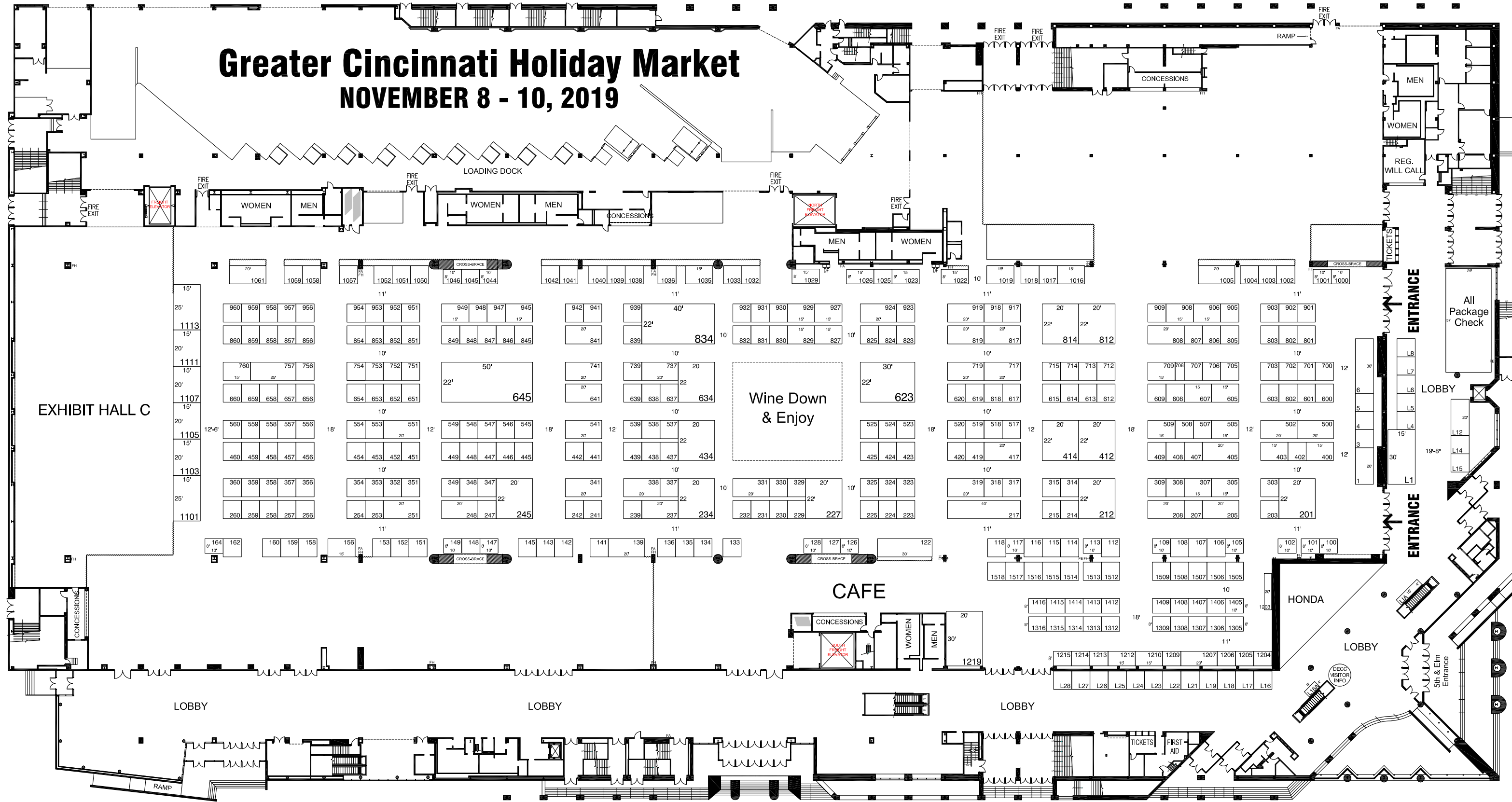
EXHIBIT HALL C